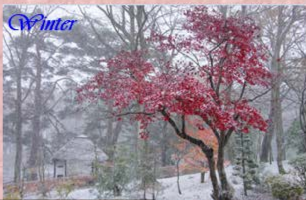
Snow-Clad Japanese Garden